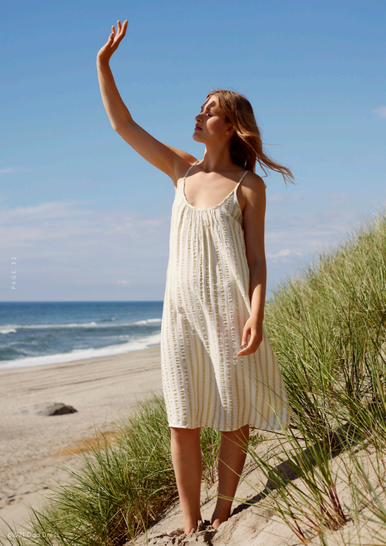
61071 Oda Dress