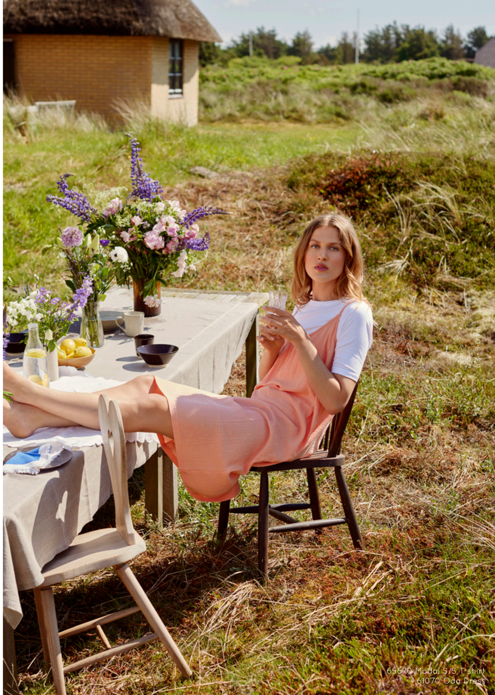
65670 Modal S/S T-shirt 61070 Oda Dress