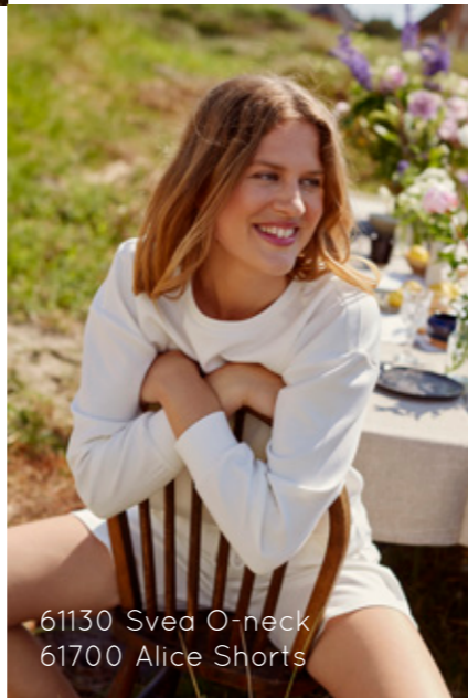
61130 Sved O-neck 61700 Alice Shorts