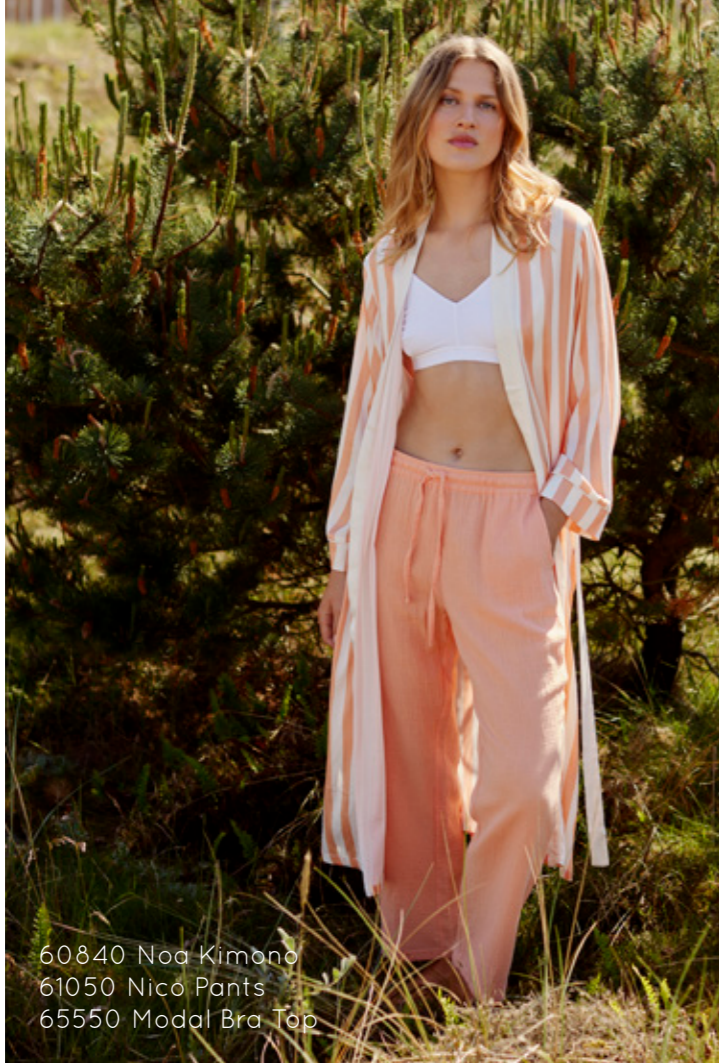
60840 Noa Kimono 61050 Nico Pants 65550 Modal Bra Top