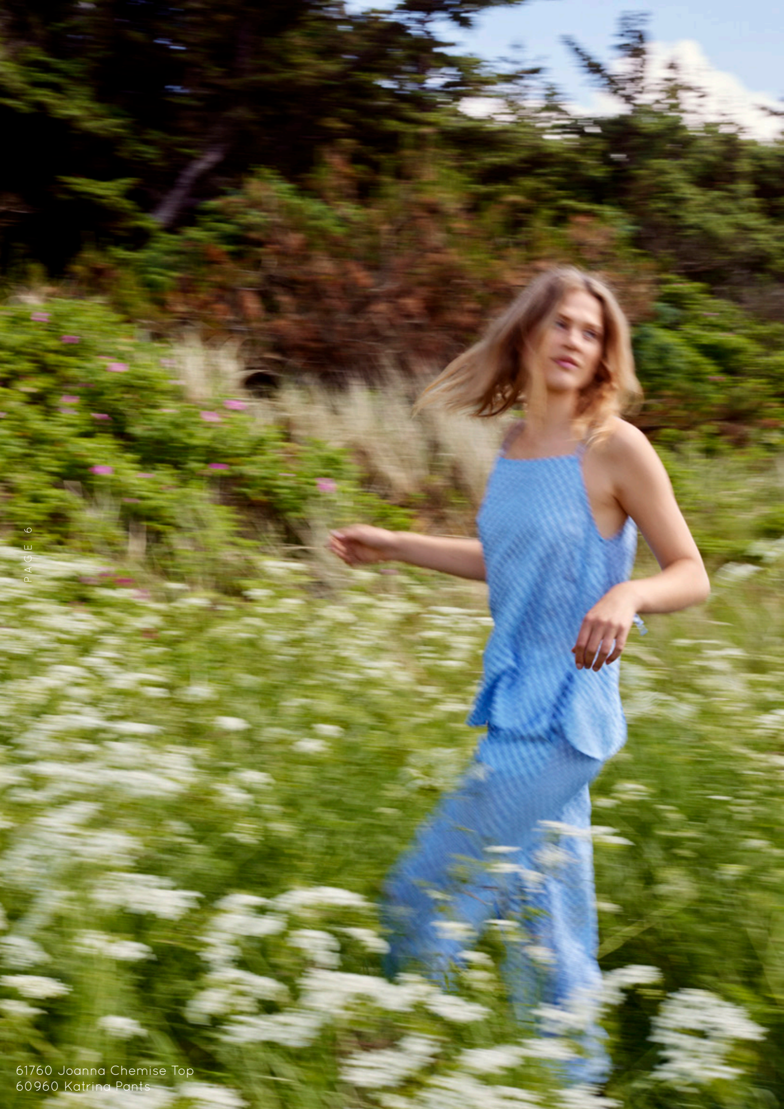
61760 Joanna Chemise Top 60960 Katrina Pants