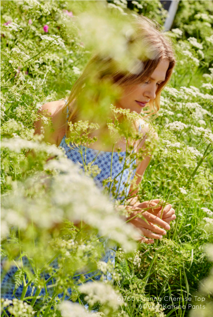
61760 Joanna Chemise Top 60960 Katrina Pants