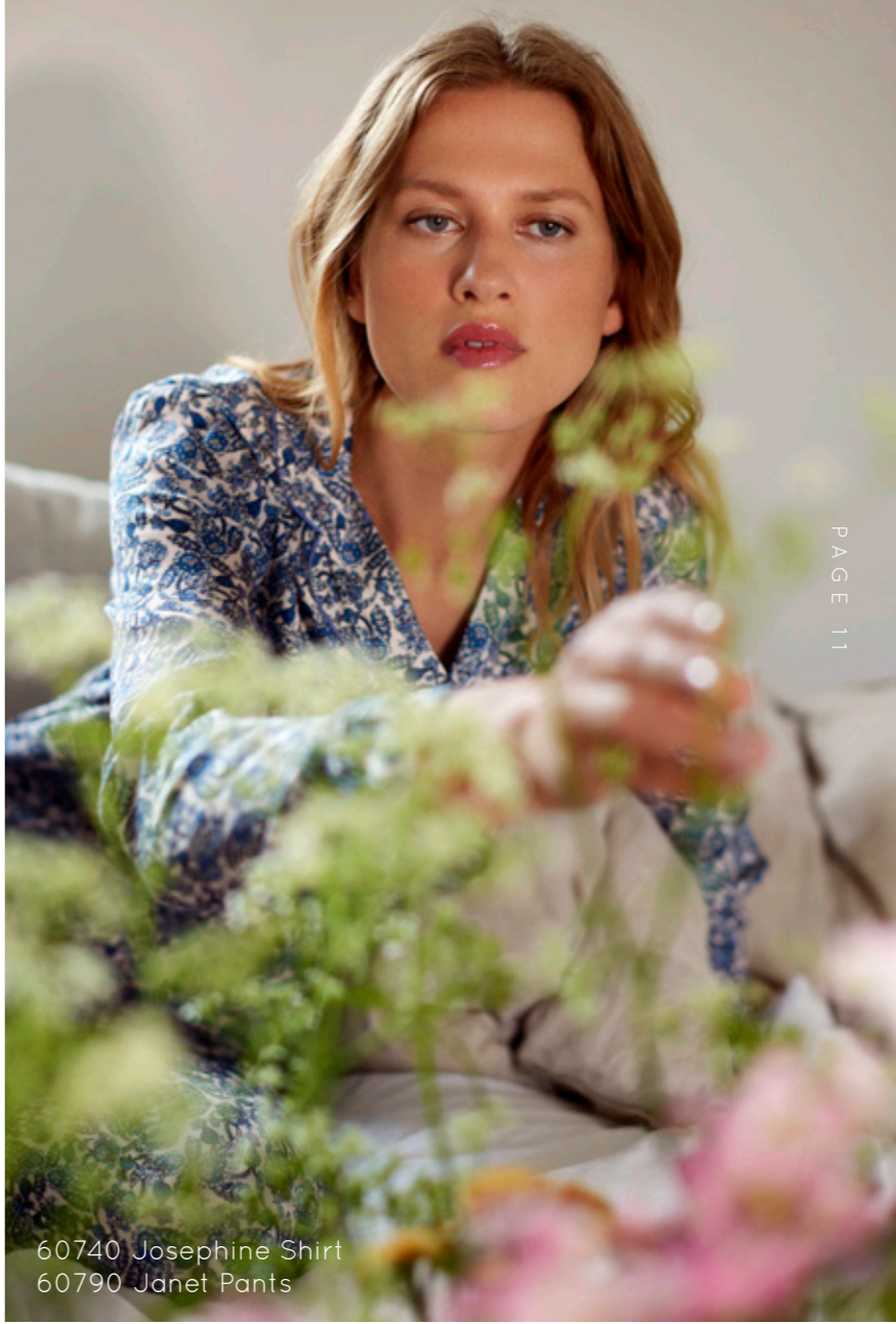
60740 Josephine Shirt 60790 Janet Pants