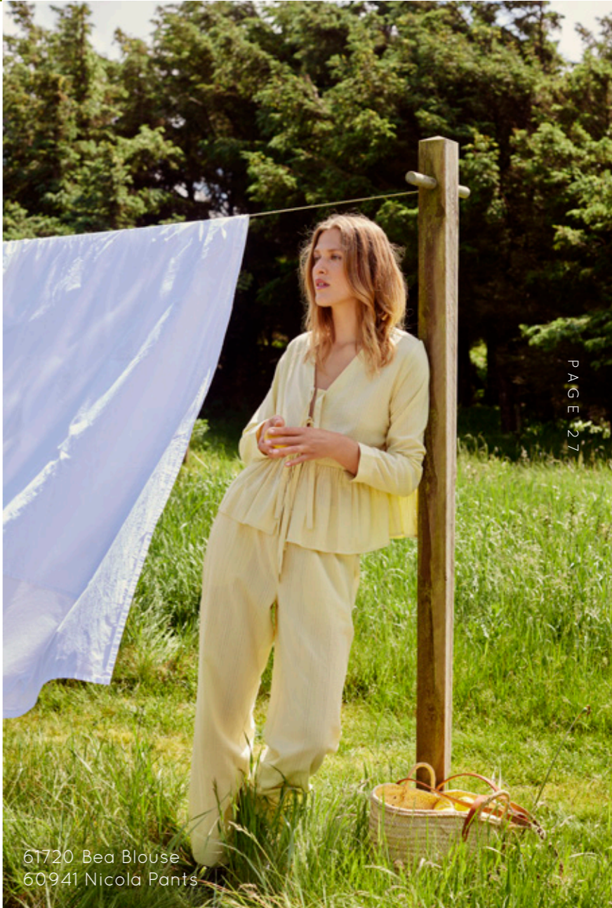
61720 Bea Blouse 60941 Nicola Pants