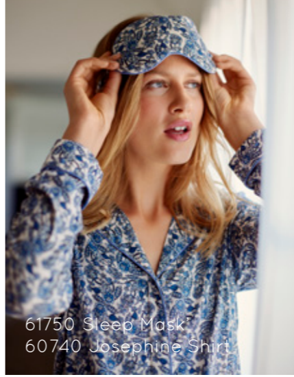
61750 Sleep Mask 60740 Josephine Shirt