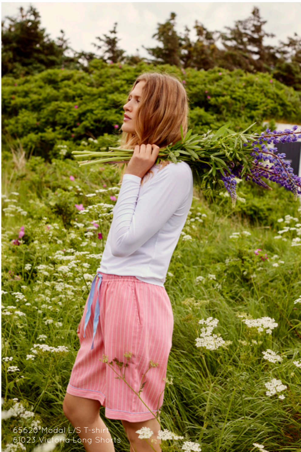
65620 Modal L/S T-shirt 61023 Victoria Long Shorts