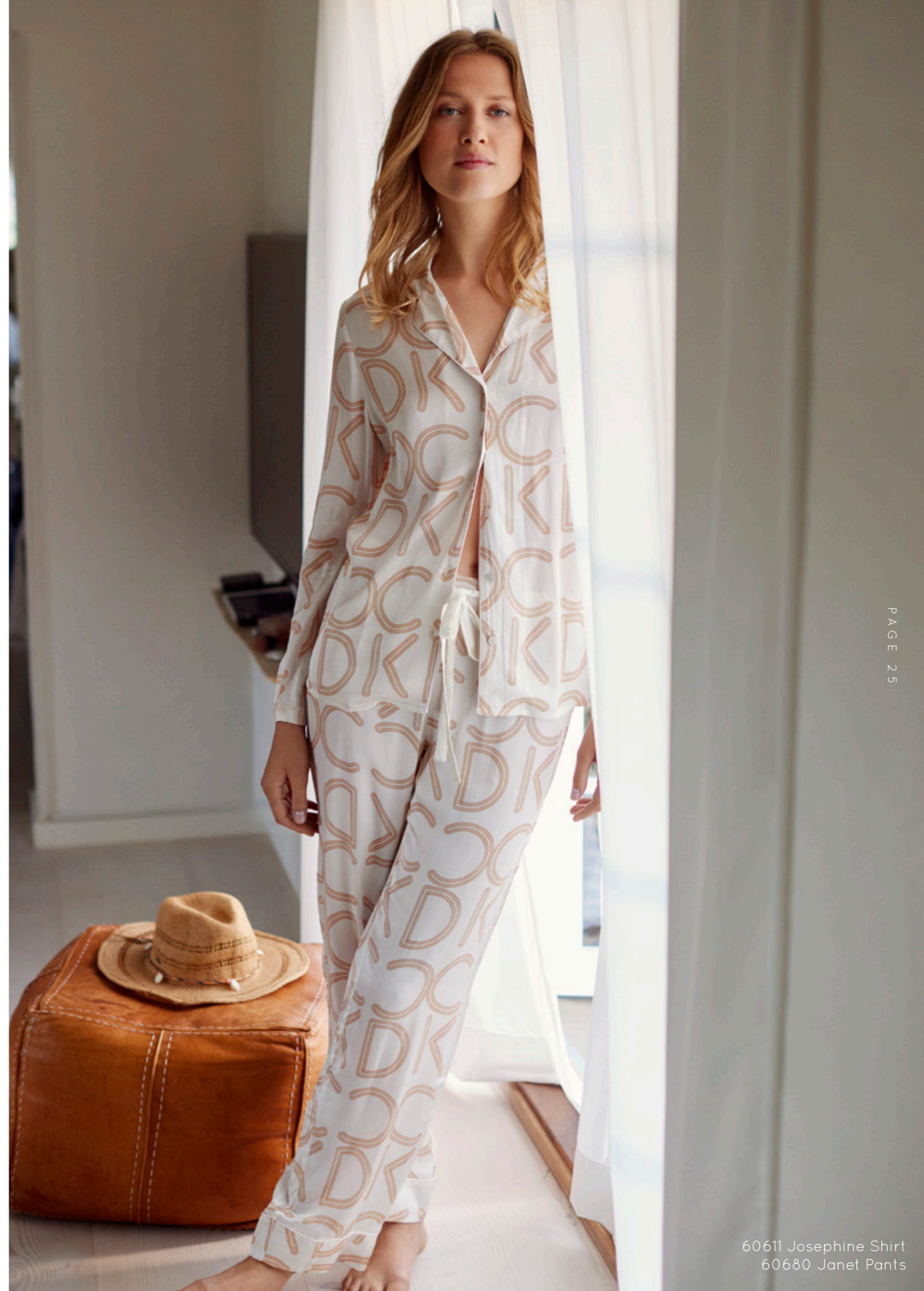
60611 Josephine Shirt 60680 Janet Pants