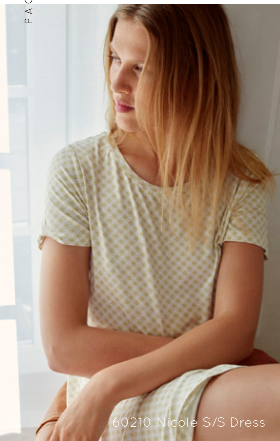
60210 Nicole S/S Dress