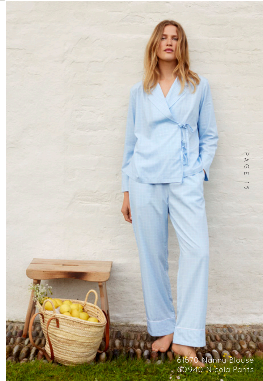
61670 Nanny Blouse 60940 Nicola Pants