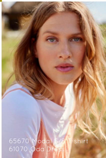
65670 Modal S/S T-shirt 61070 Oda Dress