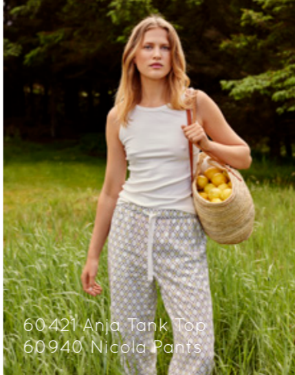
60421 Ania Tank Top 60940 Nicola Pants