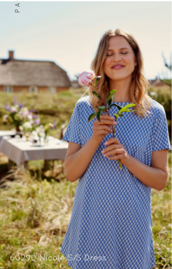
60290 Nicole S/S Dress